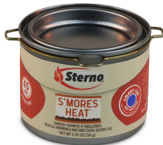
Sterno S'mores Heat (Sold Separately)