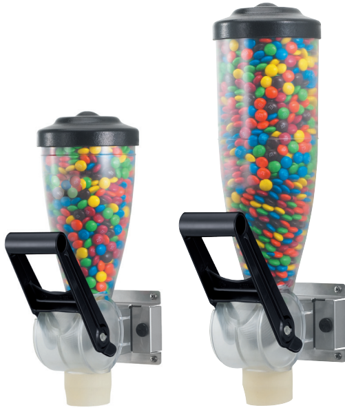
DPD 1-LITER SINGLE 86670 (LEFT) DPD 2-LITER SINGLE 86680 (RIGHT)