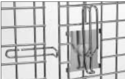
handle (open position)