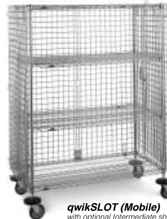
quwikSLOT (Mobile) with optional Intermediate shelves