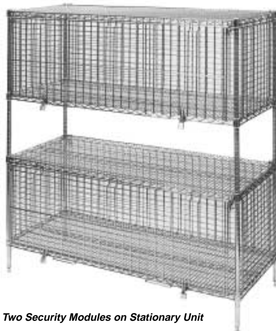
Two Security Modules on Stationary Unit