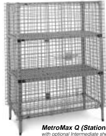
MetroMax Q (Stationary) with optional Intermediate shelves