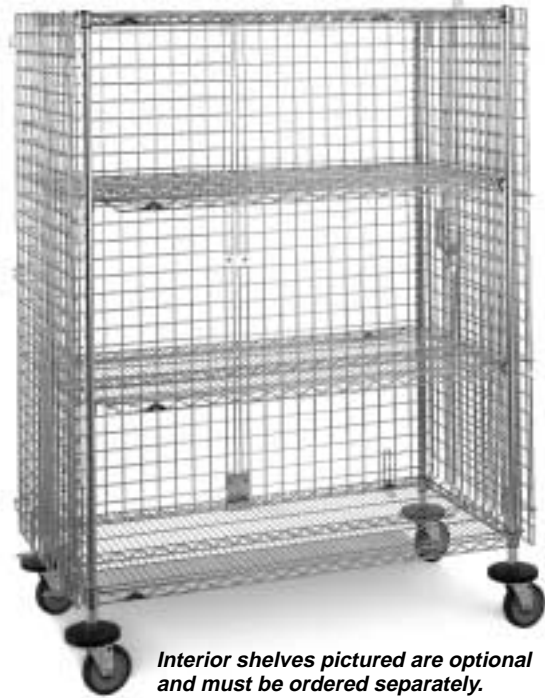
Interior shelves pictured are optional and must be ordered separately.