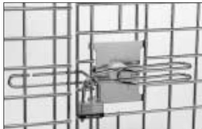
handle (closed position)