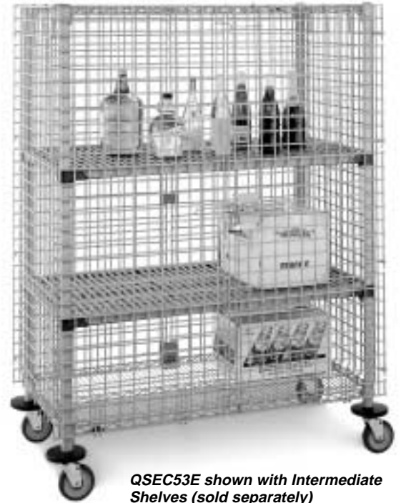
QSEC53E shown with Intermediate Shelves (sold separately)