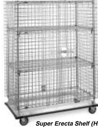
Super Erecta Shelf (HD Mobile) with optional Super Adjustable/ Super Erecta® Intermediate shelves