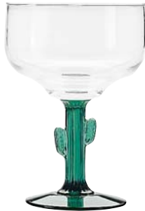
Cactus Margarita Juniper Stem No. 3620JS ● 16 oz./47.3 cl./473 ml. H6¼ T4¾ B3 D4¾ 1 doz./8# • 1.00 cu.ft. SCC 617729 TRAEX TR-8DD □