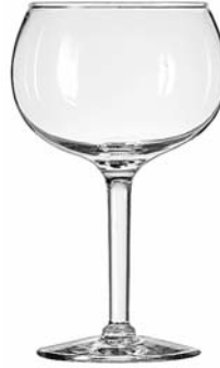
Bolla Grande® No. 8418 ● 17½ oz./51.8 cl./518 ml. H6½ T3¾ B3¼ D4¾ 1 doz./8# • 1.10 cu.ft. SCC 515028 TRAEX TR-8DDD □