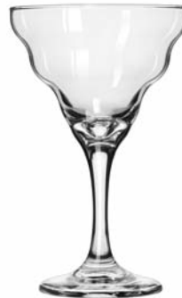
Splash Margarita No. 3429 ● 12 oz./35.5 cl./355 ml. H6½ T4½ B3 D4¾ 1 doz./8# • 1.13 cu.ft. SCC 395931 TRAEX TR-8DDD □