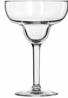
Citation Gourmet Coupette/Margarita No. 8430 ● 14¾ oz./43.6 cl./436 ml. H7 T4¾ B3¼ D4¾ 1 doz./9# • 1.39 cu.ft. SCC 378620 TRAEX TR-18JJJ □