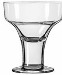
Catalina Margarita No. 3827 ■ 12 oz./35.5 cl./355 ml. H4½ T4½ B3 D4½ 3 doz./29# • 2.19 cu. ft. SCC 586721 TRAEX TR-8DD □