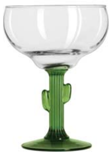
new Cactus Margarita Citrus Green Stem No. 3621CS ● 14 oz./41.4 cl./414 ml. H6 T4¼ B3 D4½ 1 doz./8# • 1.04 cu.ft. SCC 398376 TRAEX TR-18JJ □