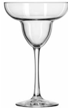
Midtown Margarita No. 7511 ▲ ● 13 oz./38.5 cl./385 ml. H7½ T4¾ B3½ D4¾ 1 doz./8# • 1.50 cu.ft. SCC 312013 TRAEX TR-18JJJ □