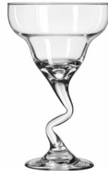
Z-Stem Margarita No. 30299 ■ 12 oz./35.5 cl./355 ml. H7 T4½ B2½ D4½ 1 doz./8# • 1.12 cu.ft. SCC 394033 TRAEX TR-18JJJ □