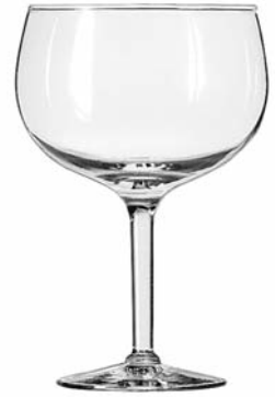
Magna Grande No. 8427 ● 27¼ oz./80.6 cl./806 ml. H7¾ T4½ B3 D5 1 doz./10# • 1.57 cu.ft. SCC 515035 TRAEX TR-10FFF □