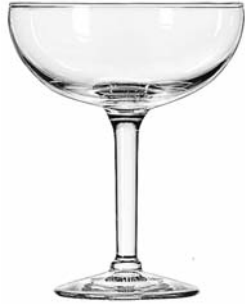
Fiesta Grande® No. 8422 ● 15¼ oz./46.6 cl./466 ml. H6½ T4¾ B3 D5 1 doz./9# • 1.38 cu.ft. SCC 113750 TRAEX TR-10FF □