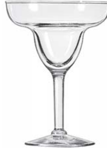
Citation Gourmet Coupette/Margarita No. 8429 ● 9 oz./26.6 cl./266 ml. H6½ T4½ B3 D4½ 1 doz./7# • 1.19 cu.ft. SCC 562152 TRAEX TR-18JJ □