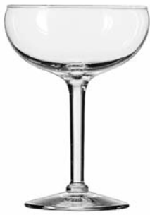
Fiesta Grande® No. 8423 ● 12 oz./35.5 cl./355 ml. H6 T4½ B3½ D4½ 1 doz./7# • 1.07 cu.ft. SCC 669455 TRAEX TR-8DD □