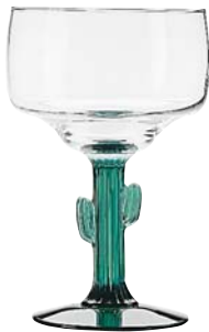
Cactus Margarita Juniper Stem No. 3619JS ● 12 oz./35.5 cl./355 ml. H6½ T3¾ B3 D4 1 doz./7# • .81 cu.ft. SCC 571932 TRAEX TR-11GG □