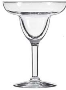
Citation Gourmet Coupette/Margarita No. 8428 ● 7 oz./20.7 cl./207 ml. H5½ T4½ B3 D4½ 1 doz./7# • 1.12 cu.ft. SCC 630189 TRAEX TR-18JJ □