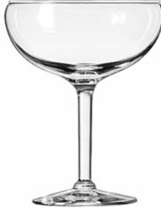
Fiesta Grande® No. 8417 ● 16¾ oz./49.6 cl./496 ml. H6¼ T4¾ B3 D5 1 doz./8# • 1.41 cu.ft. SCC 515011 TRAEX TR-10FF □