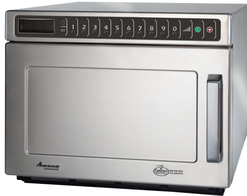
Model HDC18SD2 shown